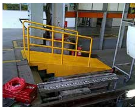
Purpose Built Ramp

For rail specific products visit Rail at www.calbah.com