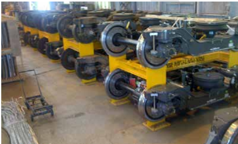
Equipment Storage – Stillages