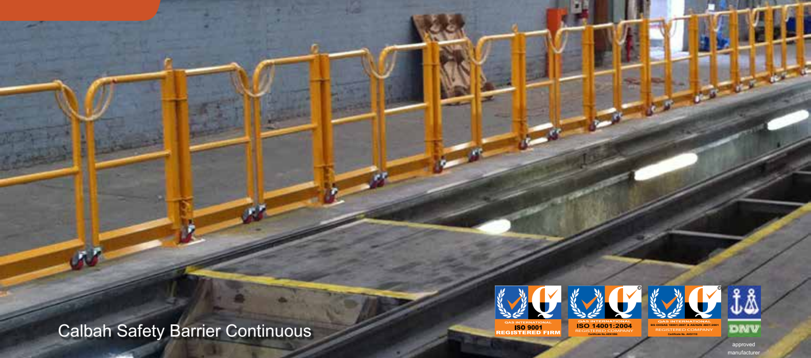
Calbah Safety Barrier Continuous