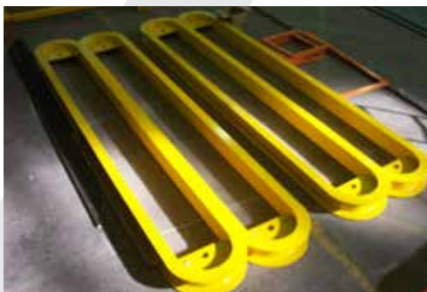
Rotomax Retaining Structure