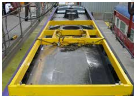
Train Equipment Jig