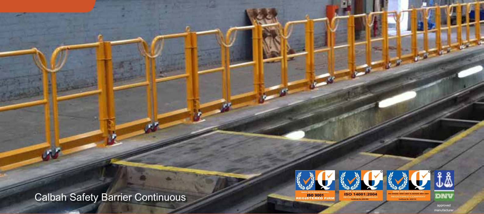
Calbah Safety Barrier Continuous