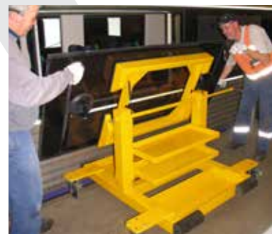
Side Window Change Table