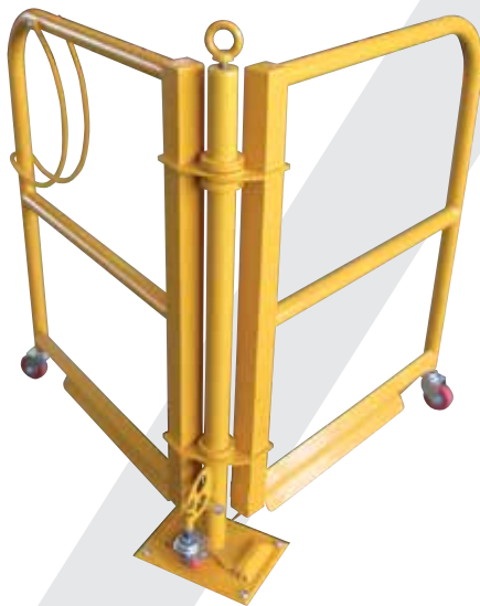
Calbah Safety Barrier

Please refer to the brochures below for our design & drafting services and range of products for the oil & gas, mining, rail and general engineering industries.