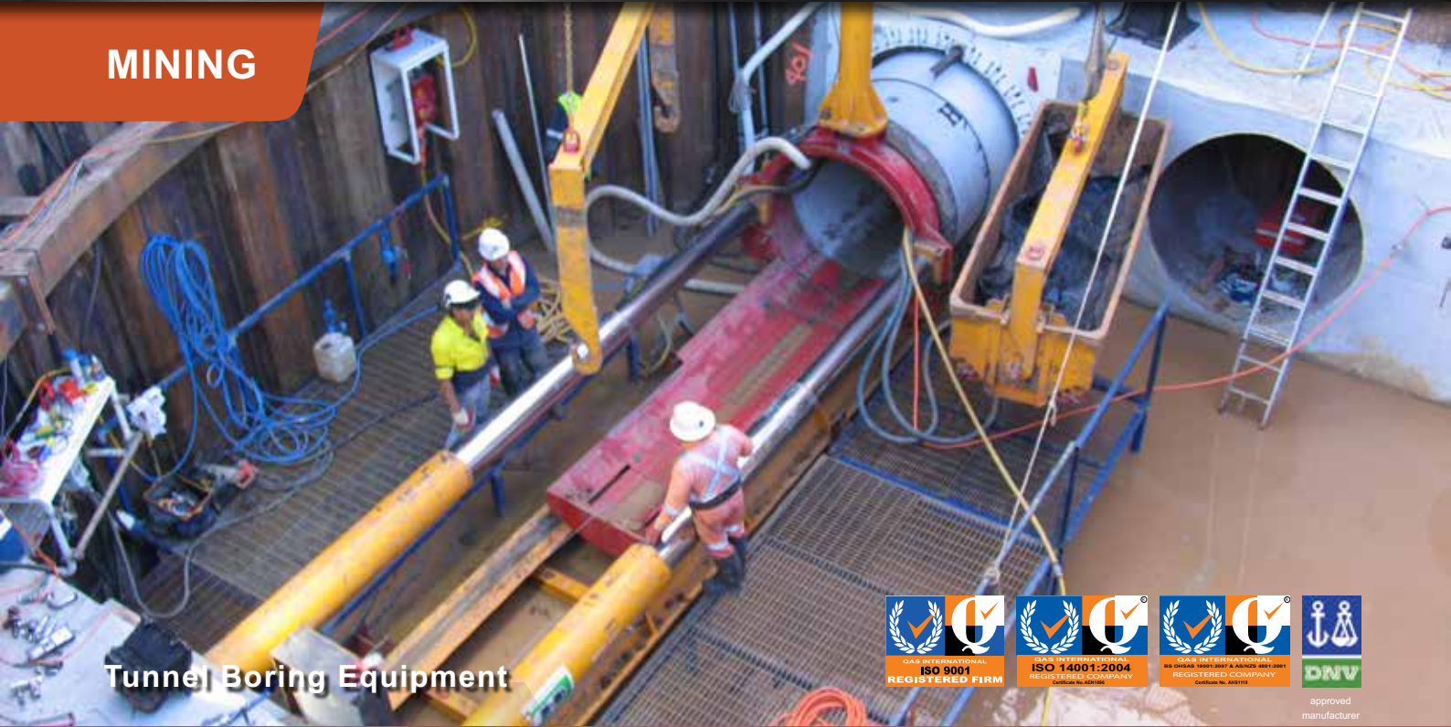
Tunnel Boring Equipment