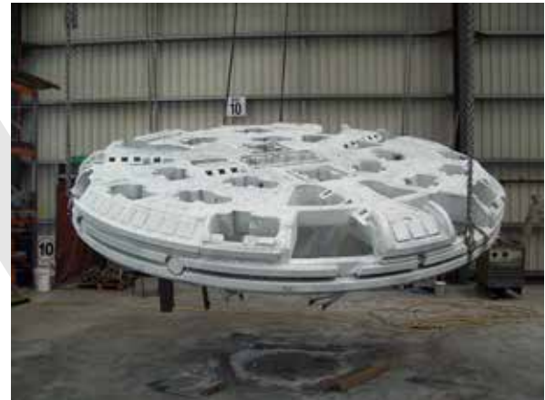
4000mm Cutter Head

Calbah never forgets the dangers of working underground and the challenges faced when products fail to perform. Quite simply, Calbah knows there are no second chances deep underground and makes no apology for the fact it takes the time to ensure every product it produces will perform.