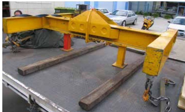
14 Ton Spreader Lift Beam