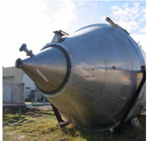
Spray Dryers and Silos