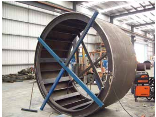
11000kg Thrust Ring for Tunnel Jacking