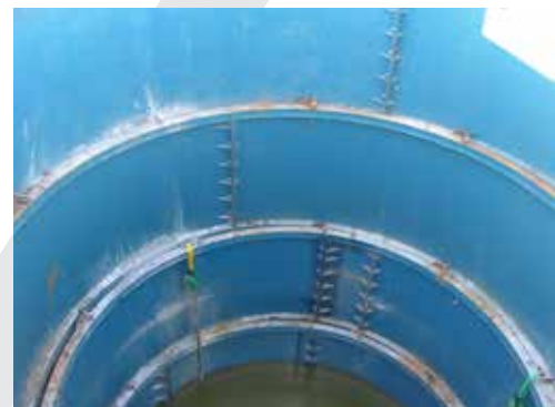
Vertical Shaft Lining

Calbah is one of the most accredited firms in the sector. Our list of accreditations include ISO 9001:2008 - Quality Systems, BS OHSAS 18001 - Health and Safety, AS 14001:2004 – Environment Systems and supply DNV 2.7-1 and DNV 2.7-3 certification for all offshore products.