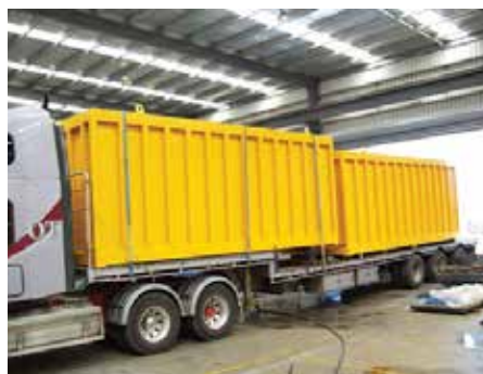
Oil and Gas Special Tanks

For mining specific products visit Mining at www.calbah.com