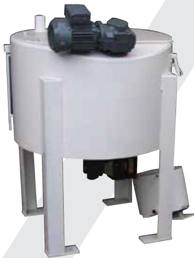
Agitator for Mining

Please refer to the brochures below for our design & drafting services and range of products for the oil & gas, mining, rail and general engineering industries.