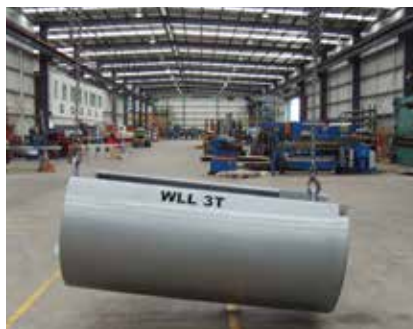
3 Ton SWL Tipping Bucket