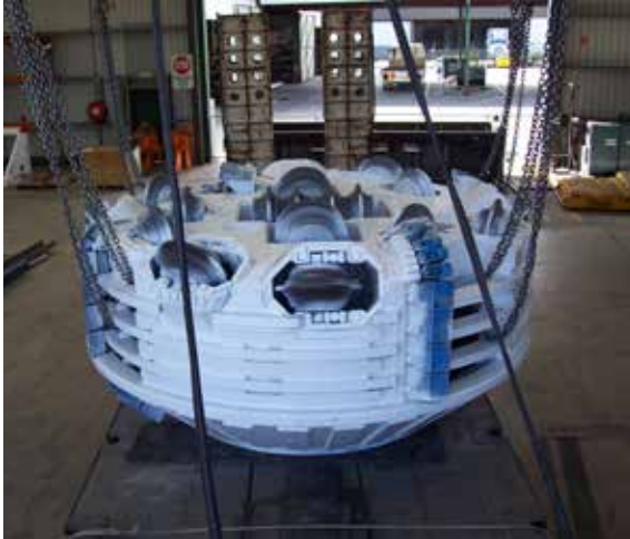
TBM Cutter Rebuild