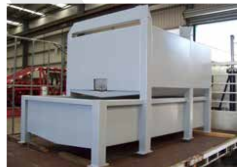
Acid Tank with Bund for Chemical Industry