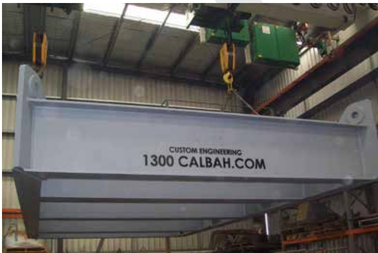
Engineered Steel Skid