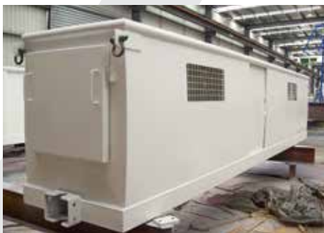
9 Person Car